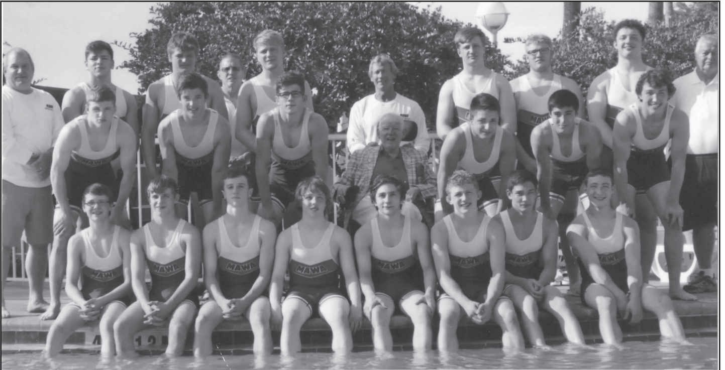
MAWA BLUE 12-0 NATIONAL A.A.U. CHAMPIONS